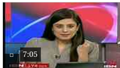
CBSE Class XII Exam Toppers Interview 2010 YouTube · 5/21/2010 ·