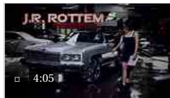
Mann - Buzzin (Remix) ft. 50 Cent YouTube · 12/23/2010 ·